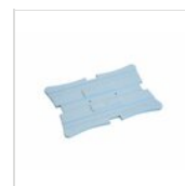
Ze Pé standard ice pack rectangular (12 pcs box) 50303453