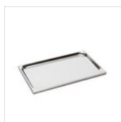
FANTASY stainless steel tray GN 1/1 VASSOIO GN 20