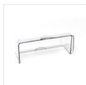
FANTASY roll top cover GN 1/1 without mounting system CLOCHE GN