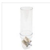
Round cereal container (3l) MULINO PACK 3L