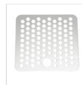
Square stainless steel drip grill 14 x 14 cm GRI-QUADRA

For manufacturing necessities, the mentioned specifications are not binding and could be changed without prior notice. Sales conditions are available upon request. Being wood a natural product, the shown colors are only indicative. Possible color and grain differences in comparison with samples and previous shipments are not reasons for claim. All parts and materials with direct food contact have been tested and approved for food contact according to the rules established by law. All rights reserved - ©Ze Pé.