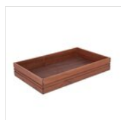
NATURE bread box GN 1/1 15A01150