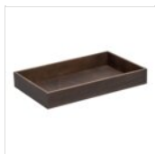
WOODEN DISPLAY GN 1/1 82100013