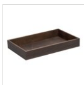
WOODEN DISPLAY GN 1/1 82100013