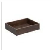
WOODEN DISPLAY GN 1/2 82100015