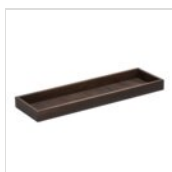
Wooden display GN 2/4 82100017