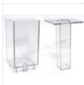
Container and ice tube for rectangular juice dispenser (6l) CONT+ICE 01(6L)