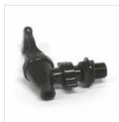
Black standard faucet RUB-P

For manufacturing necessities, the mentioned specifications are not binding and could be changed without prior notice. Sales conditions are available upon request. Being wood a natural product, the shown colors are only indicative. Possible color and grain differences in comparison with samples and previous shipments are not reasons for claim. All parts and materials with direct food contact have been tested and approved for food contact according to the rules established by law. All rights reserved - ©Ze Pé.